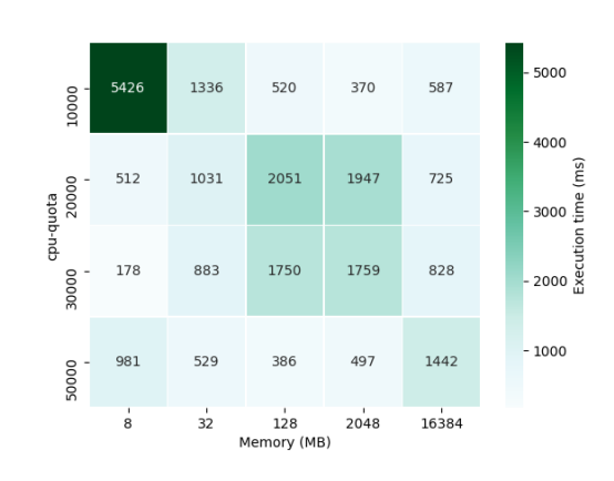
Figure 3. Prediction error for different Docker runtime options

impact of the number of initial measurements we expect the developer to perform. This is a trade-off between the burden on the developer and the accuracy of the resulting model. To better estimate the execution time of edge applications, we want to extend our framework with additional features for the model generation such as the availability of a GPU and the size of the applications input. Both of these features influence the execution time. Our prototype's current predictions are only valid for the hardware platform the measurements were performed on. We want to investigate the possibility of predicting the execution time for different hardware platforms. In summary, this work shows the potential of our initial prototype and with our planned work, we expect further improvements to our framework.